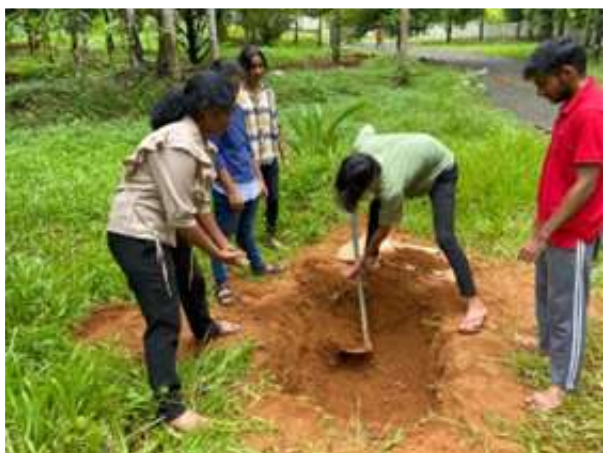
Utilizing Green Campus