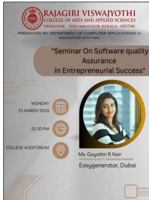
Poster of the Seminar on Software Quality Assurance in Entrepreneurial Success

assurance can be strategically integrated into software development processes to enhance business outcomes.