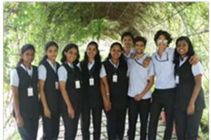
Utilizing the Green Campus