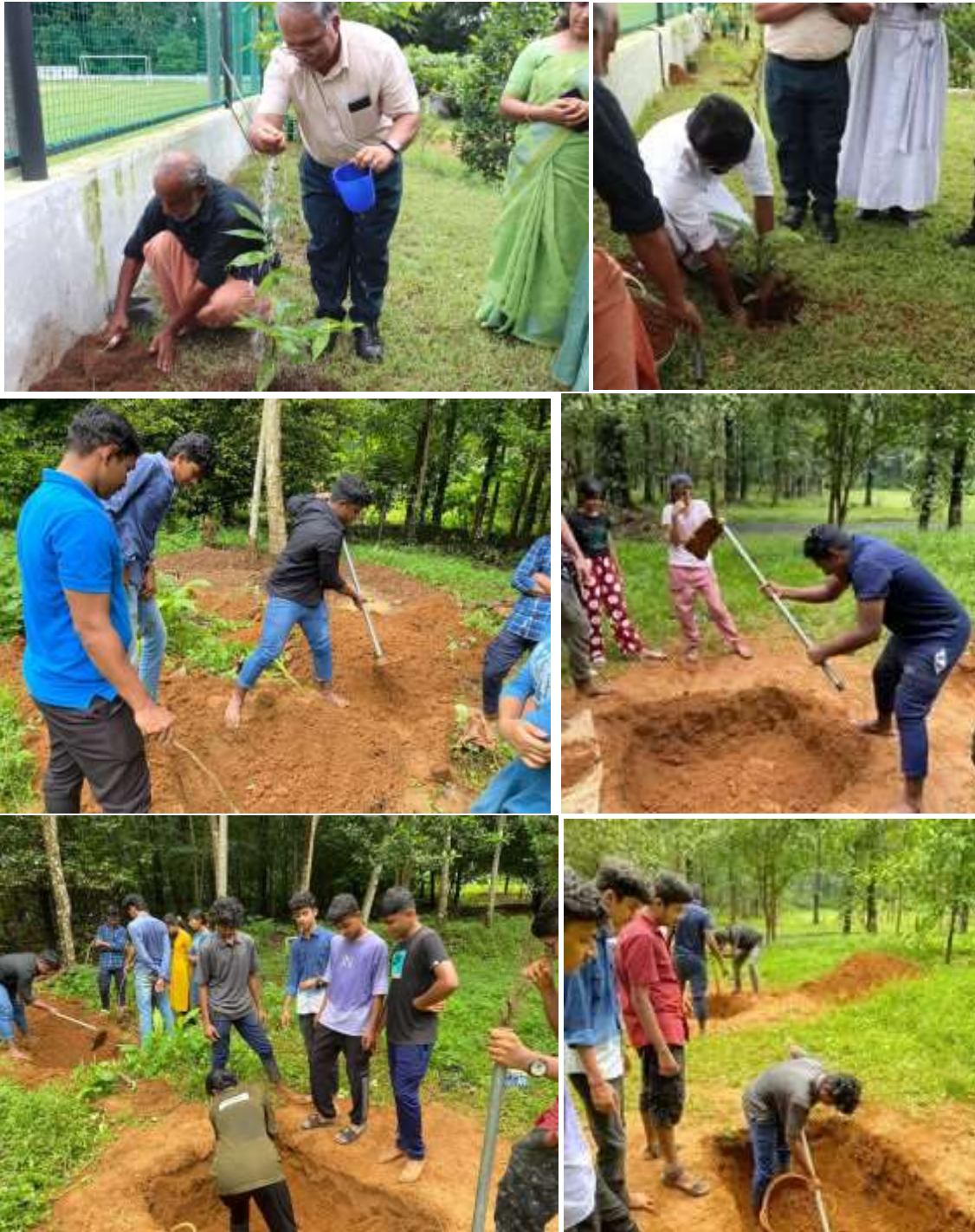
Utilizing the Green Campus