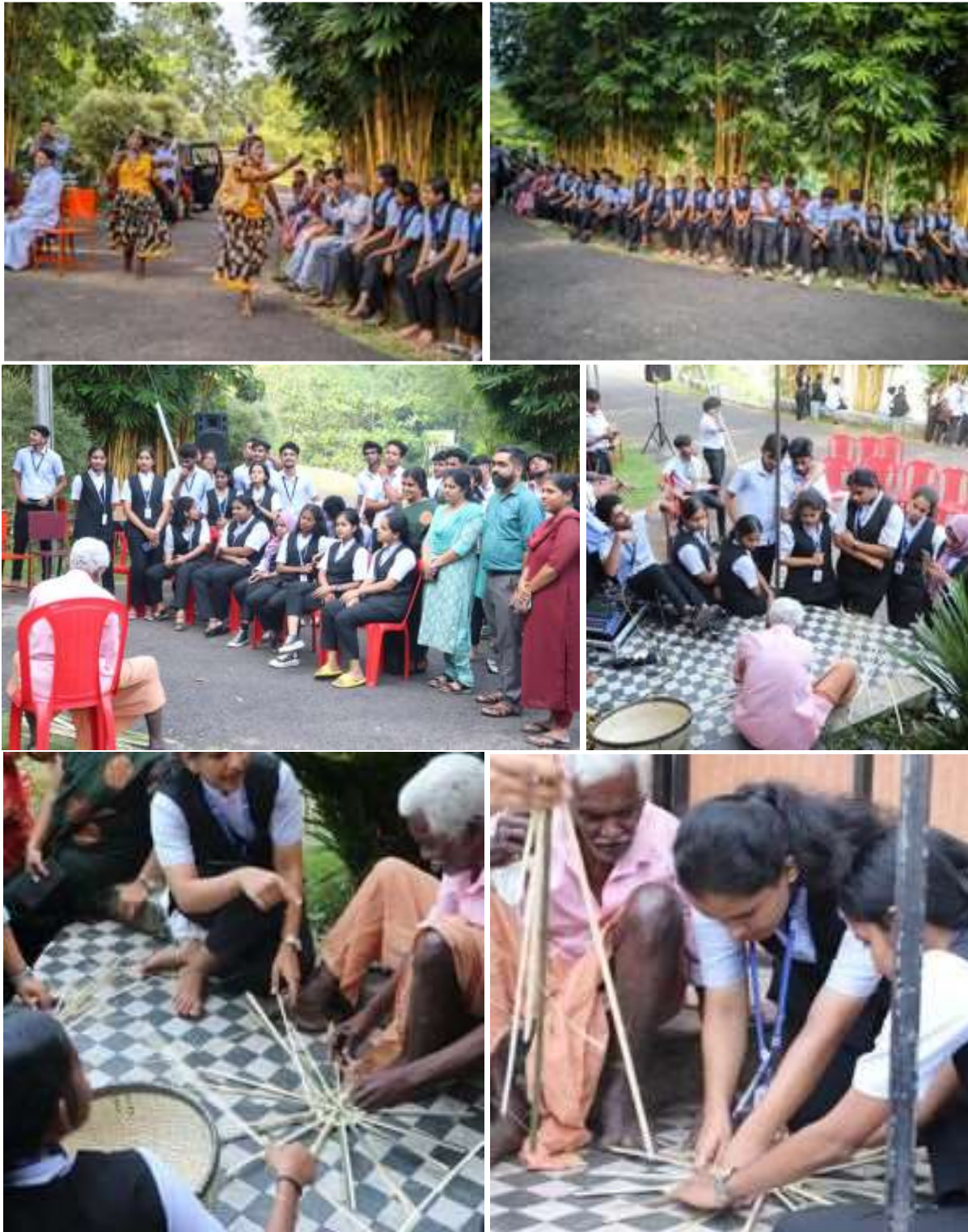
Utilizing the Green Campus