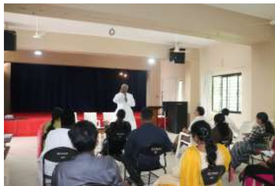
Vidyut 2K23 (Academic Planning-Internal FDP)