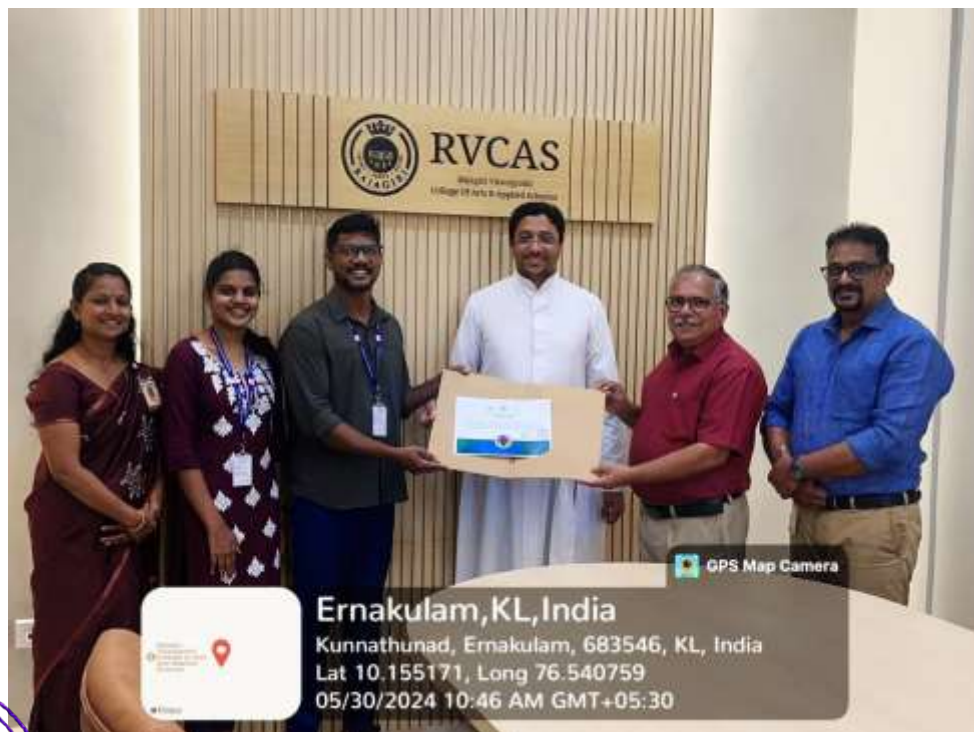
Certificate of Green Institution