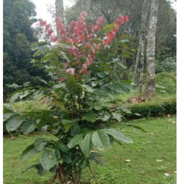
Utilizing Green Campus