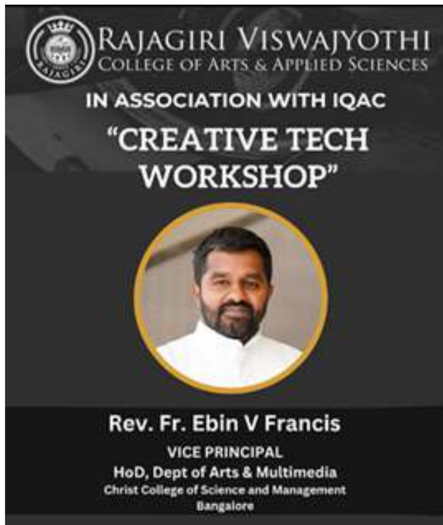
Poster of Creative Tech Workshop