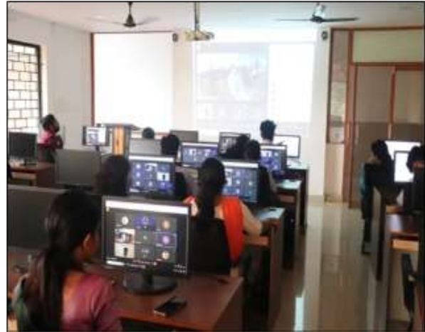
Participants attending Online Workshop: “Navigating Online Copyrights in Fictional Works”