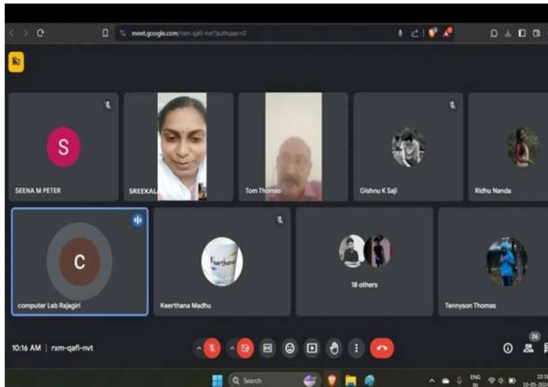
Screenshot of the Webinar