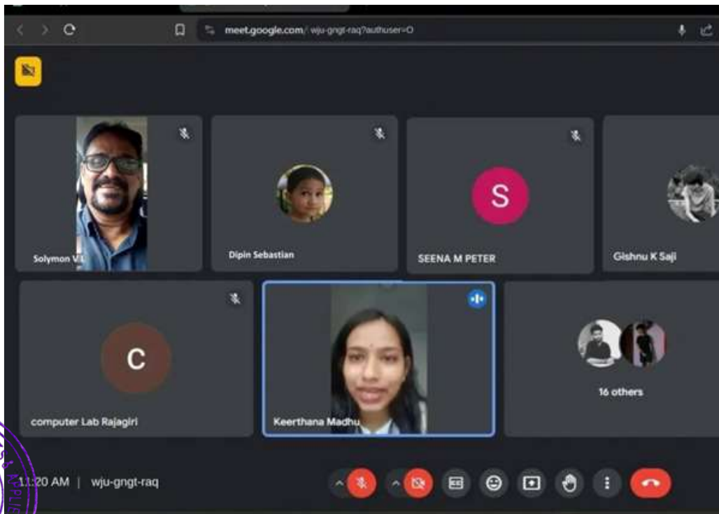
Screenshot of the Future Focus: Career Orientation and Guidance Programme