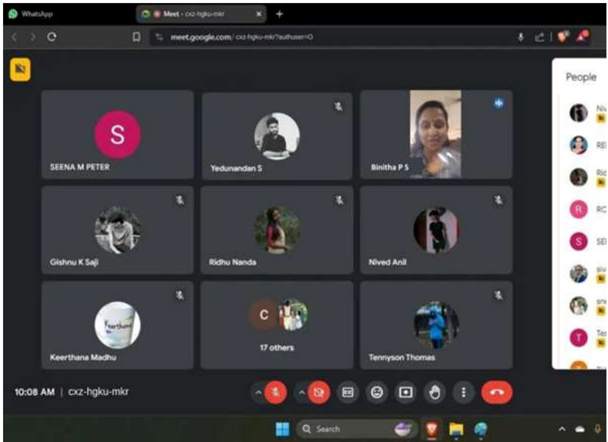
Screenshot of Competitive Exam Mastery, Personalized Coaching Programme