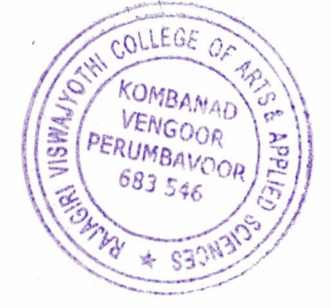
PRINCIPAL Rajagirí Viswajyothi College of Arts & Applied Sciences Vengoor, Perumbavoor-683 546