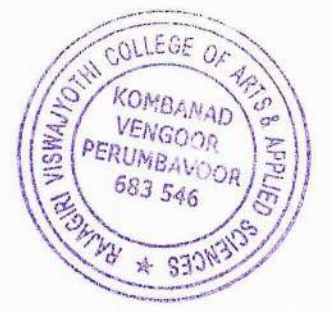
PRINCIPAL Rajagiri Viswajyothi College of Arts & Applied Sciencer Vengoor. Perumbavoor-68