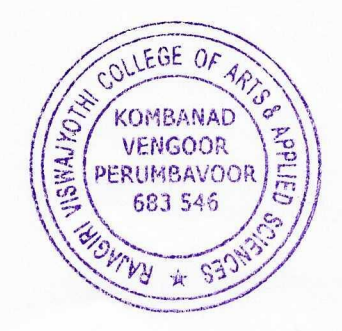
PRINCIPAL Rajagıri Viswajyothi College of Arts & Applied Sciences Vengoor, Perumbavoor-683 546