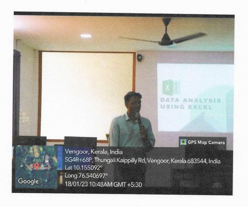
Photo of the Workshop "Training on Fundamentals of Microsoft Excel"