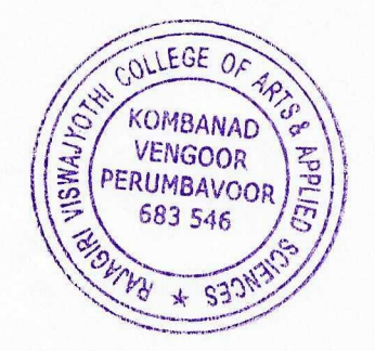
PRINCIPAL Rajagıri Viswajyothı College of Arts & Applied Sciences Vengoor, Perumbavoor-683 546