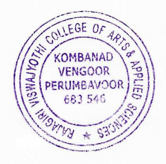
PRINCIPAL Rajagıri Viswajyothı College of Arts & Applied Sciences Vengoor, Perumbavoor-683 546