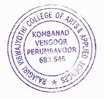
PRINCIPAL Rajagırí Viswajyothi College of Arts & Applied Sciences Vengoor, Perumbavoor-683 546