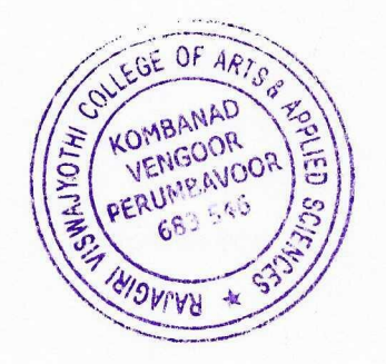
PRINCIPAL Rajagıri Viswajyothı College of Arts & Applied Sciences Vengoor, Perumbavoor-683 546