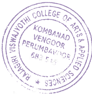
PRINCIPAL Rajagiri Viswajyothi College of Arts & Applied Sciences Vengoor, Perumbavoor-683 546